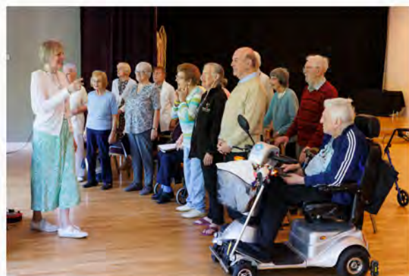
A Community Choir rehearsal led by SFE staff member

Our Community Choir offers people aged 55+ the chance to come together to share their love of singing and reduce isolation, particularly impacting people with dementia, helping them rekindle a passion and/or a memory.