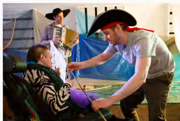
An SFE staff member with a Tiger Tiger participant

Led by experienced staff, our Birmingham Inclusive Choir and Tiger Tiger projects create special musical moments for children and young people with disabilities, offering fully inclusive music-making and sensory based activities at their level of choice and engagement.