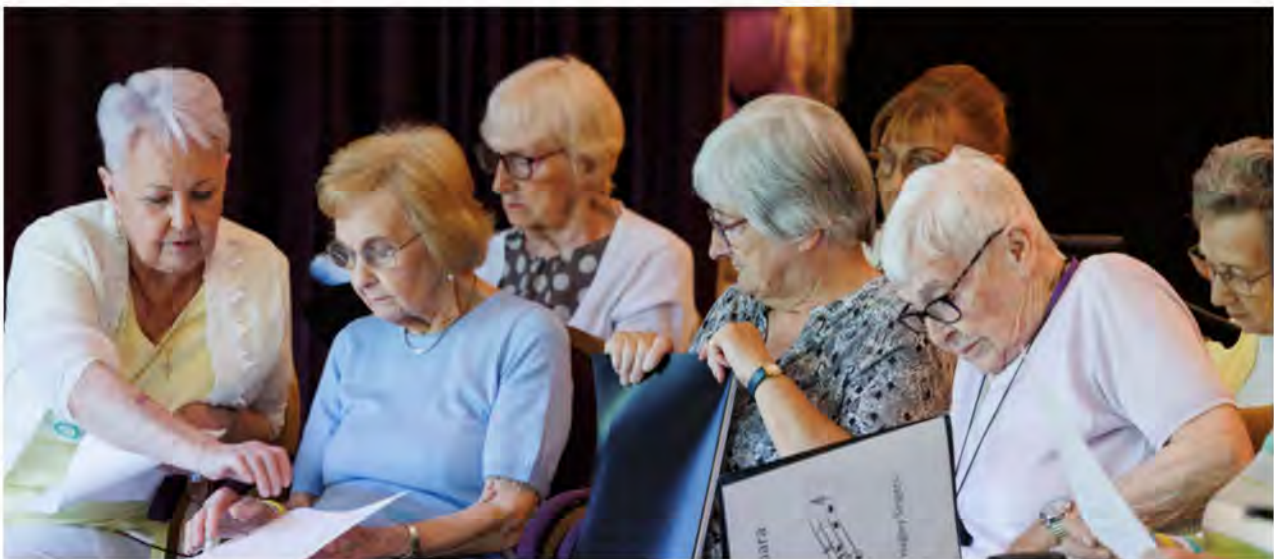
Our Community Choir members

We are a really diverse group and I love the camaraderie, the respect for one another and the development. so that we can collectively produce a more cohesive sound as a group. This is an amazing accomplishment given that many of us including myself don't read music and only ordinarily sing into shampoo bottles in the shower!