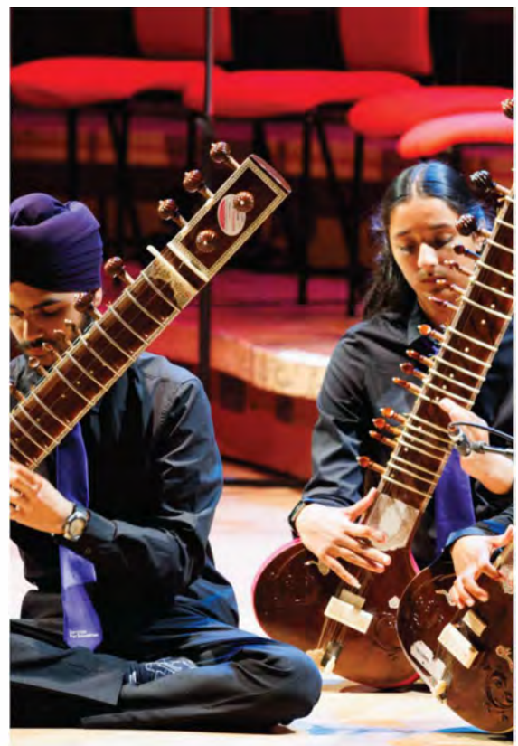
Sitar musicians at a Youth Proms event